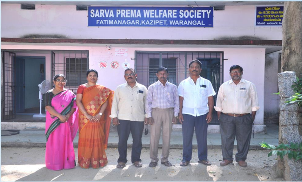
SPWS - Governing Body