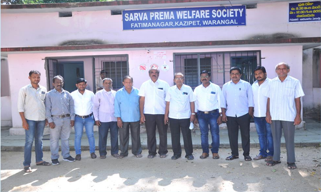
SPWS - Team